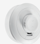
SMKT-900 Smoke/Heat/Freeze Detector