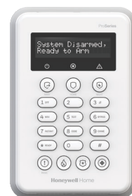
Wireless Touchpad: PROSIXLCDKP